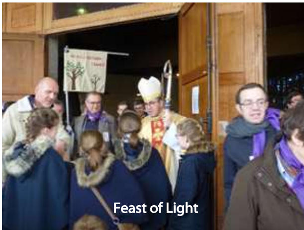
Feast of Light