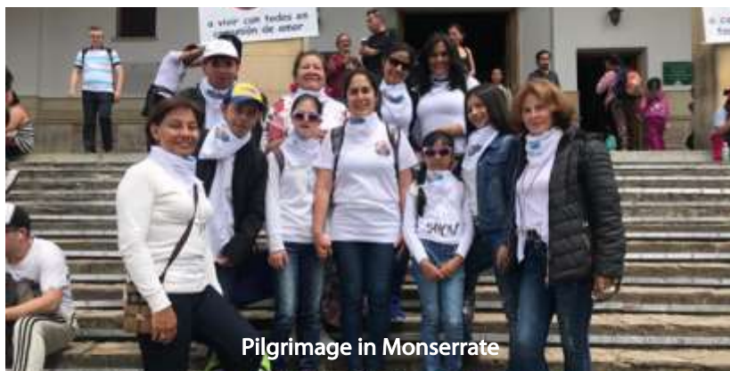
Pilgrimage in Monserrate