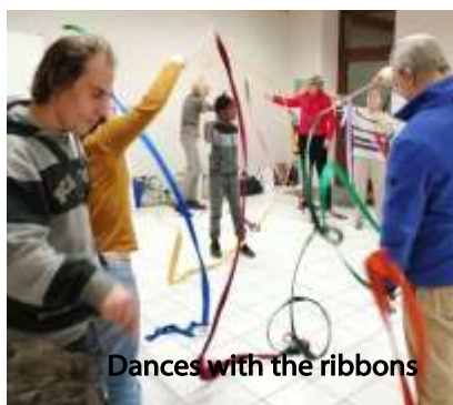
Dances with the ribbons