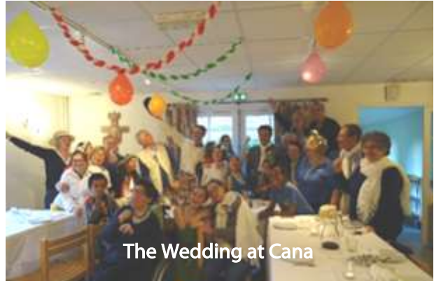
The Wedding at Cana