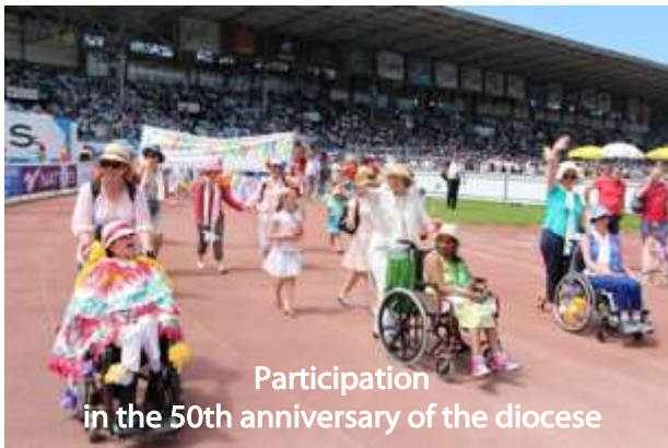
Participation in the 50th anniversary of the diocese