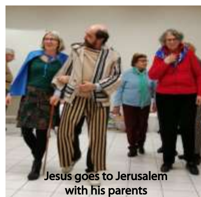
Jesus goes to Jerusalem with his parents